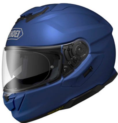
MATTE BLUE METALLIC