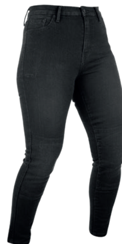
LADIES BLACK Available in Short