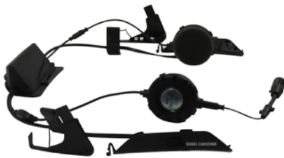
NEW SENA INTEGRATED UNIT Sold Separately