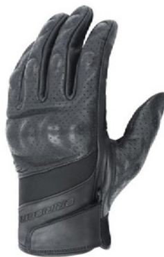
TOUR AIR $89.90RRP