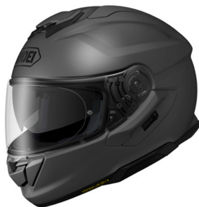
MATTE DEEP GREY