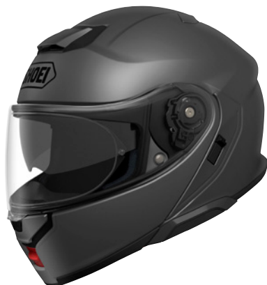
MATTE DEEP GREY