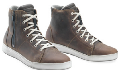
OILED AQUATECH BROWN