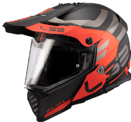
ADVENTURER MATTE BLACK/ORANGE