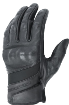
TOUR BLACK $89.90RRP