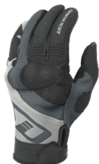
RX-ADVENTURE - GREY $79.90RRP