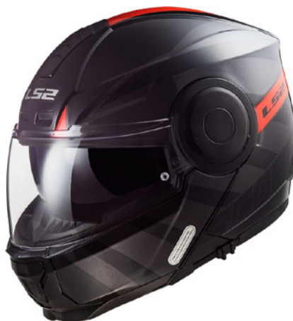
HAMR BLACK TITANIUM