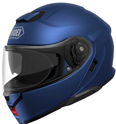
MATTE BLUE METALLIC