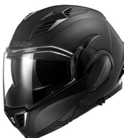
NOIR MATTE BLACK