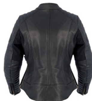
LADIES BLACK LEATHER