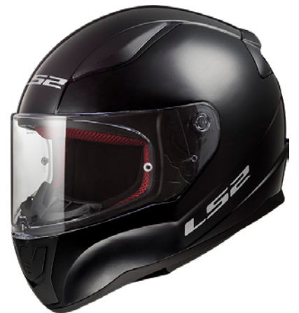
KIDS RAPID MINI