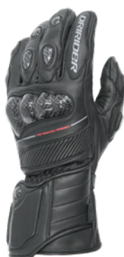
SPEED 2 LONG CUFF $119.90RRP