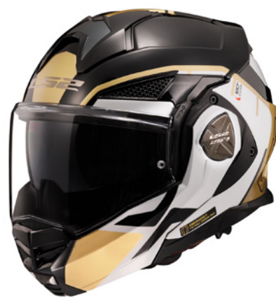
METRYK BLACK SAND