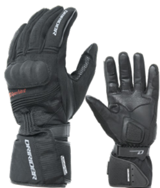
ADVENTURE 2 $159.90RRP