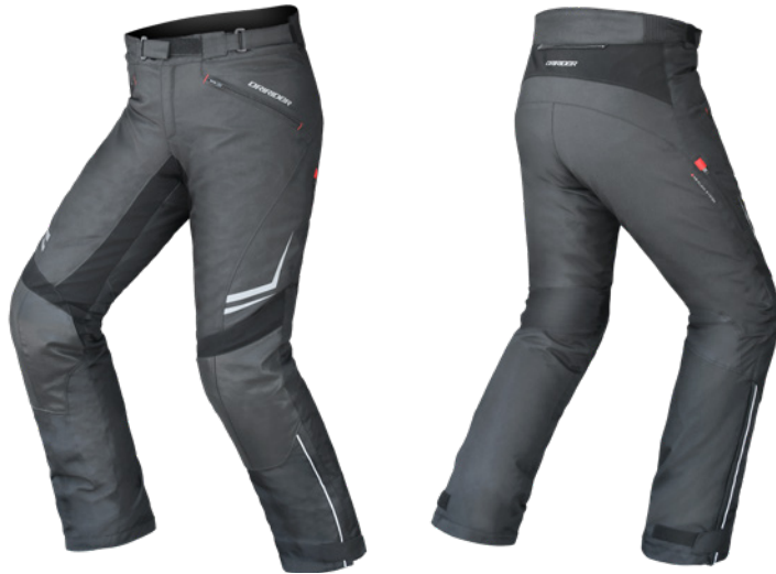
BLACK Available in Short