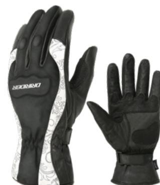
VIVID 2 LADIES $109.90RRP