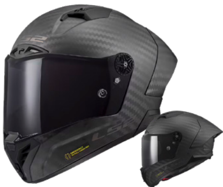
THUNDER GP PRO FIM