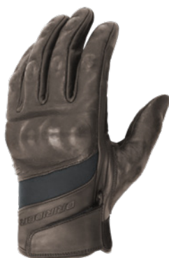
TOUR BROWN $89.90RRP