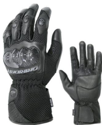
AIR-RIDE 2 $119.90RRP