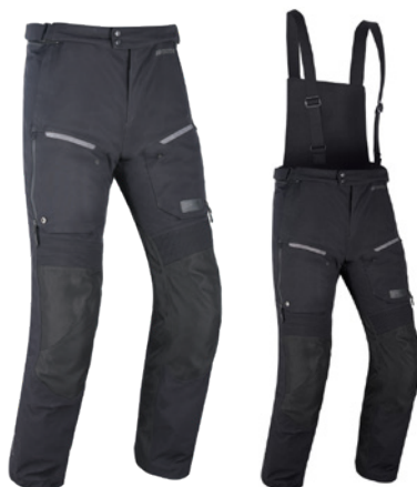
BLACK Available in Short & Ladies