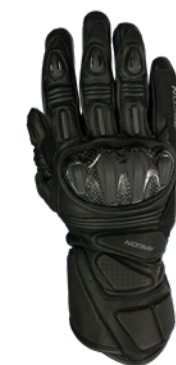
ENGAGE BLACK & RED $229.00RRP