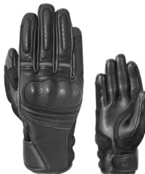
ONTARIO LADIES $99.90RRP