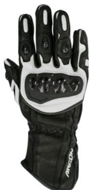
RUSH LADIES $154.90RRP