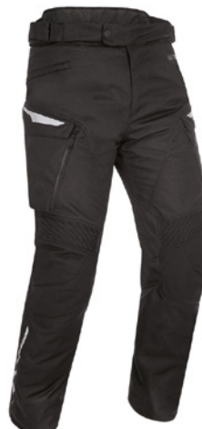
BLACK Available in Short