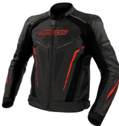
DESCENT NP BLACK/RED