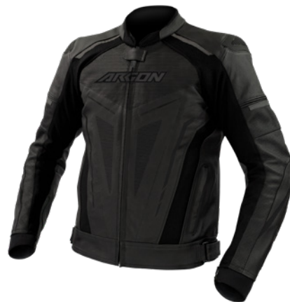
DESCENT NP BLACK