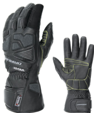
APEX 2 $124.90RRP