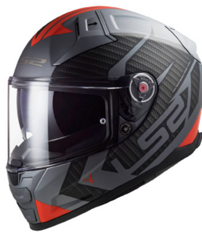
SPLITTER MATTE TITANIUM/RED