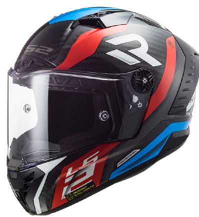
THUNDER SUPRA RED/BLUE