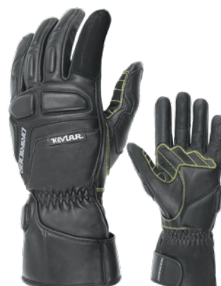
ASSEN 2 $99.90RRP