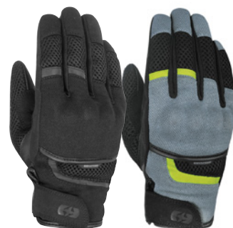
BRISBANE AIR BLACK BRISBANE AIR GREY/HI VIS $79.90RRP