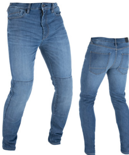
BLUE SLIM Available in Short and Long