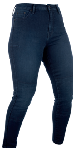
LADIES INDIGO Available in Short