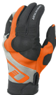
RX ADVENTURE - ORANGE $79.90RRP