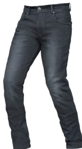
BLACK Available in Short