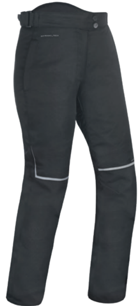
LADIES BLACK Available in Short