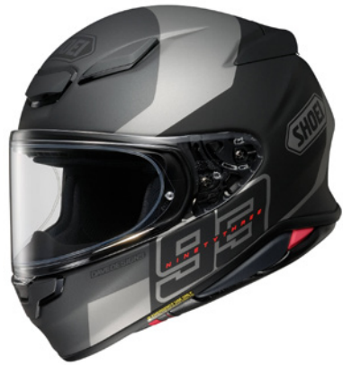
MM93 COLLECTION RUSH TC5