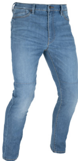
BLUE STRAIGHT Available in Short and Long