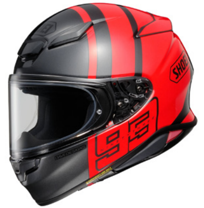
MM93 COLLECTION TRACK TC1