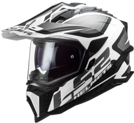
ALTER MATTE BLACK/WHITE