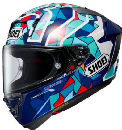
MARQUEZ BARCELONA TC10