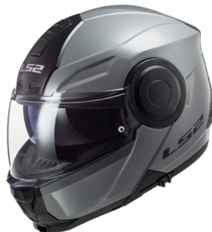
MAX NARDO GREY