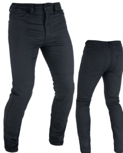
BLACK SLIM Available in Short, Long and Extra Long