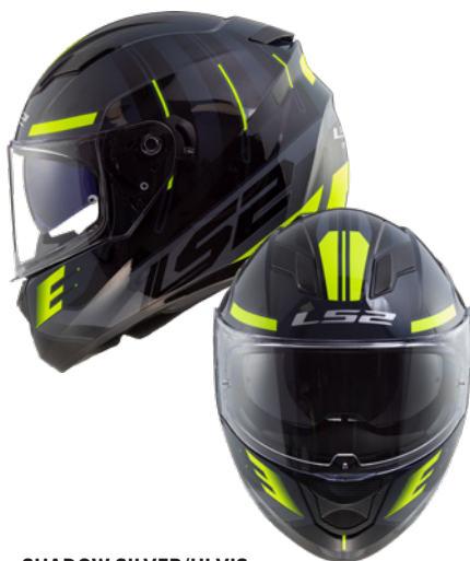
SHADOW SILVER/HI VIS