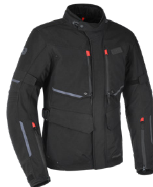
BLACK Available in Ladies