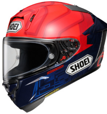
MARQUEZ 7 TC1