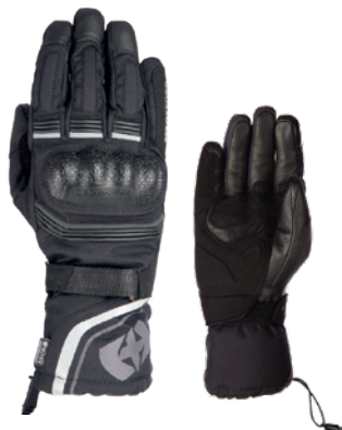
MONTREAL 4.0 $119.00RRP