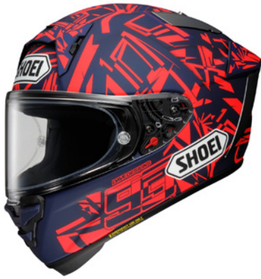
MARQUEZ DAZZLE TC10