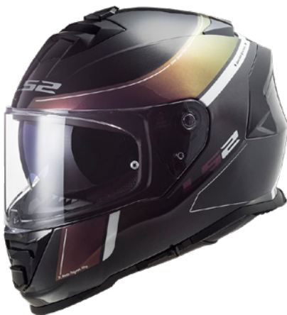
VELVET BLACK RAINBOW