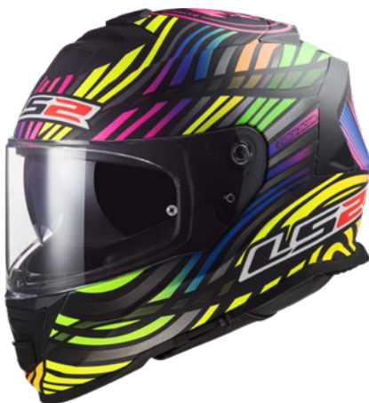
POWER MATTE BLACK RAINBOW