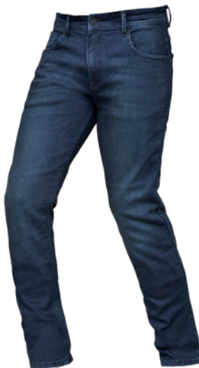
INDIGO Available in Short