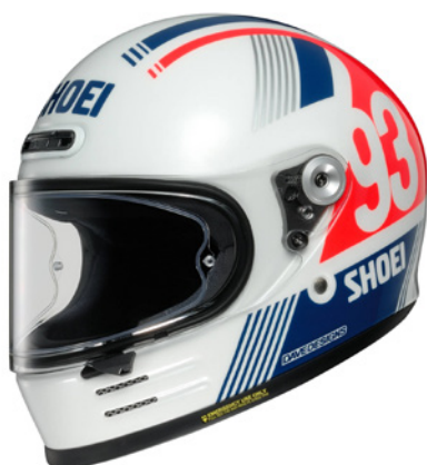
MM93 RETRO TC10