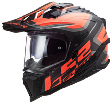
ALTER MATTE BLACK/ORANGE