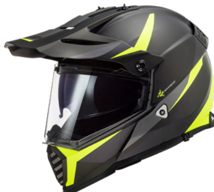
ROUTER MATTE BLACK/HI-VIS