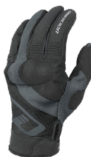
RX ADVENTURE - BLACK $79.90RRP