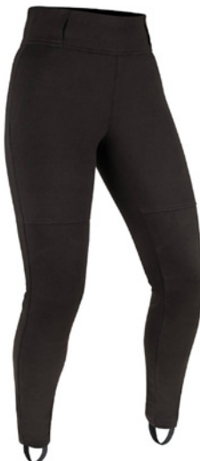
LADIES BLACK Available in Short