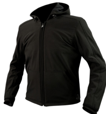
REMOVABLE HOODED JACKET