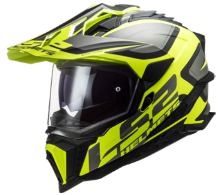
ALTER MATTE BLACK/HI VIS YELLOW