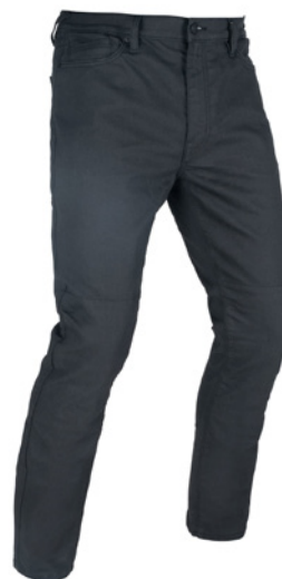
BLACK STRAIGHT Available in Short, Long and Extra Long