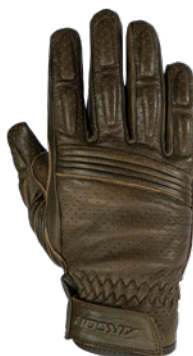
CLASH COFFEE & BLACK $99.90RRP