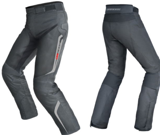
BLACK Available in Short & Ladies