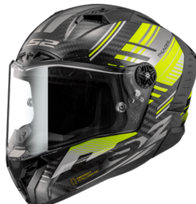
THUNDER C VOLT