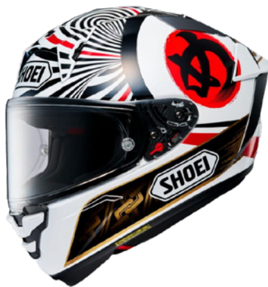
MARQUEZ MOTEIG4 TC1