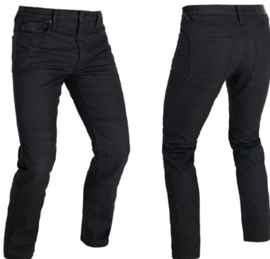
BLACK STRAIGHT Available in Short and Long