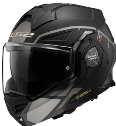
METRYK MATTE TITANIUM