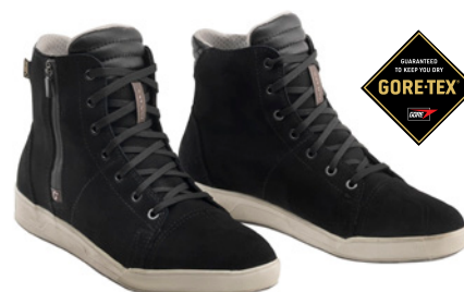
GORE-TEX CDG LADIES