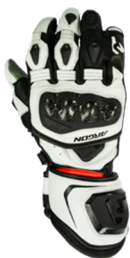
MISSION WHITE & BLACK $289.90RRP