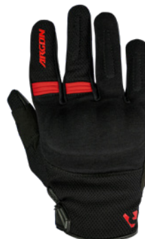
SWIFT BLACK/RED & BLACK $79.90RRP